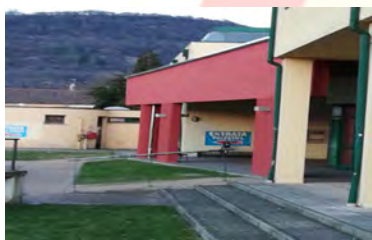
Outside Multi-purpose gym, Brendola (VI)

Lunch and dinner are arranged in the area for Saturday 27 th .