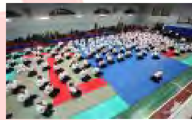
Inside Multi-purpose gym, Brendola (VI)

Brendola is a green oasis in the midst of urbanized areas. The surrounding territory is rich and varied, and the resulting products are genuine and of high quality. Viticulture occupies a prominent place in the agricultural sector of Brendola, involving about 45% of all cultivated land. With its great biological variety, Brendola is home to many varieties of grape, native of the Berici hills. The Garganega, the white grape present in greatest amount, is a local delicacy, from which we obtain different varieties of wine. Other white wines are typical to the Tai Bianco, Pinot Bianco, and Sauvignon. Among the red remember the Red Tai, the Carmenère, Cabernet Franc and Sauvignon, and Merlot.